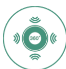
5m voice pickup range